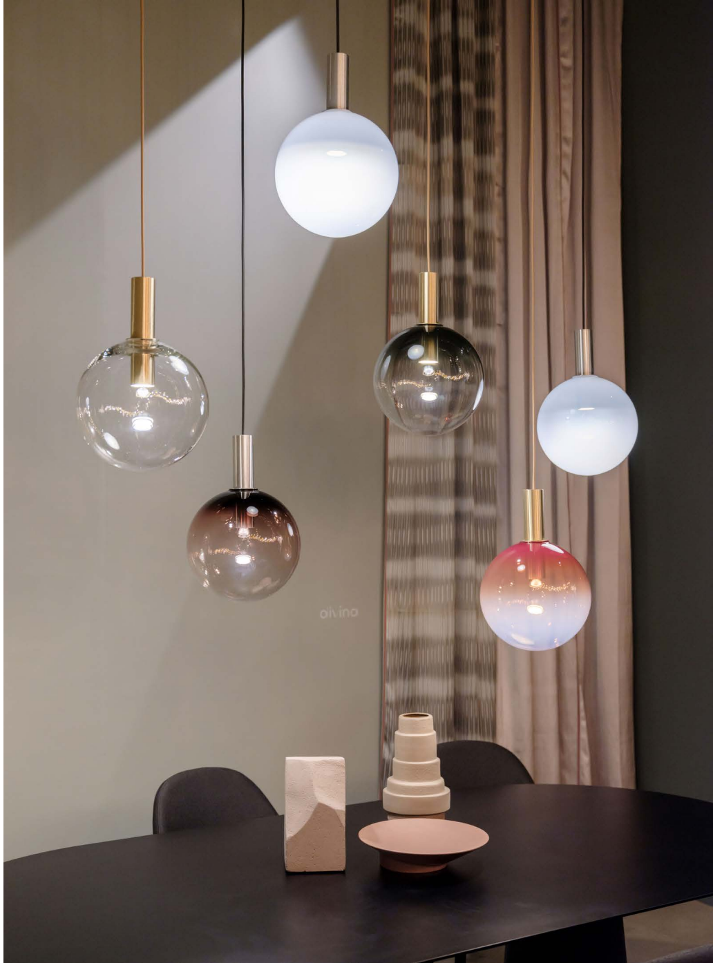
Divina at Salone del Mobile 2023, Milan